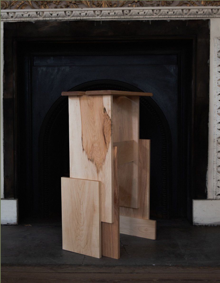
Occam Bar Stool