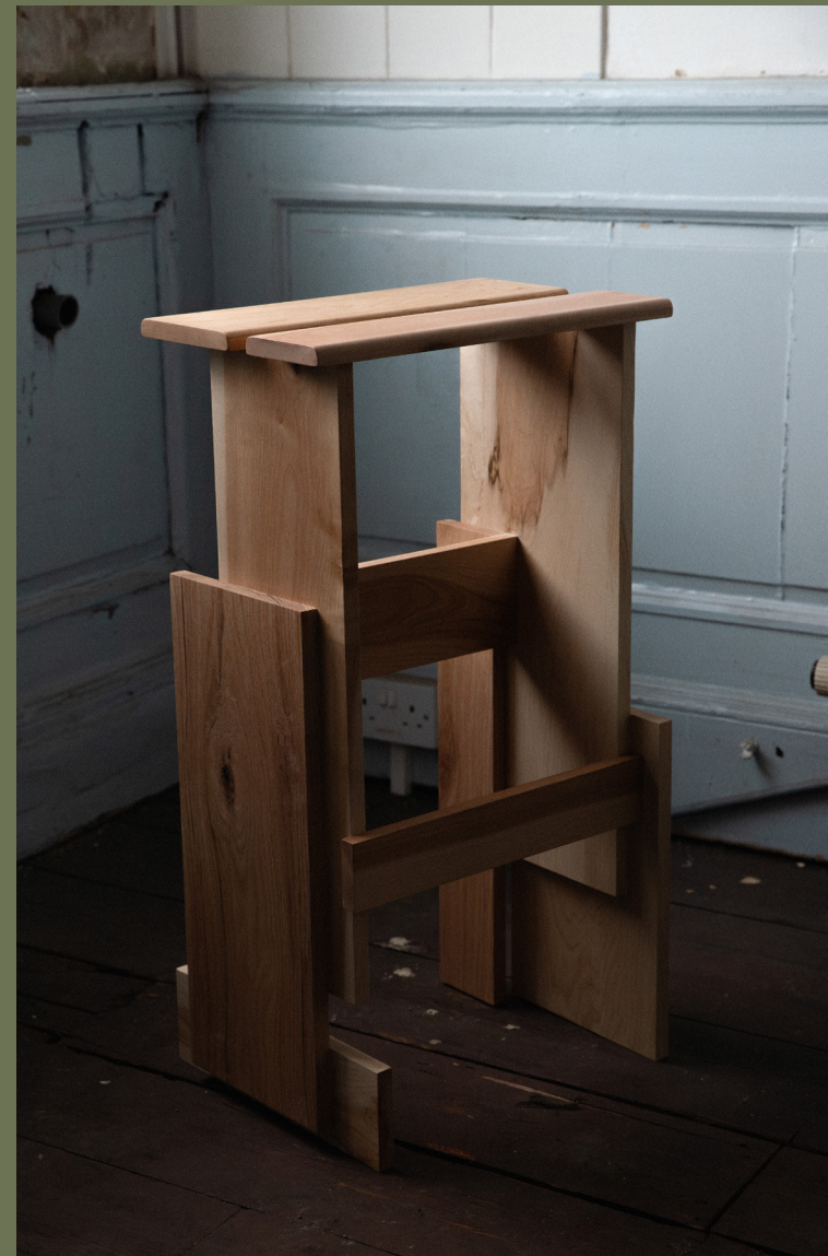
Occam Bar Stool