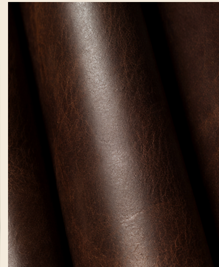
OIL TANNED LEATHER