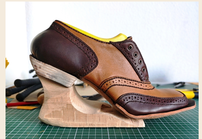
The heel lift and wooden heel are connected and further shaped into a structural base