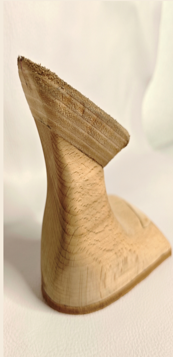
HAND-SHAPED VEG TAN HEEL LIFTS & BEECH WOOD BASE

A structural heel material referencing traditional shoe lasts