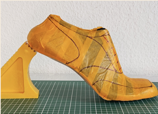
A classic Spectator design is sketched directly onto a men's high heel last