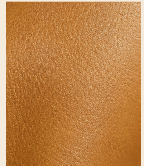
VEGETABLE TANNED LEATHER