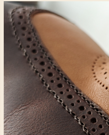
WAXED LINEN THREAD