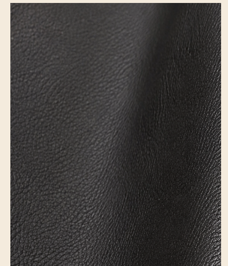
VEG TAN GOATSKIN LINING