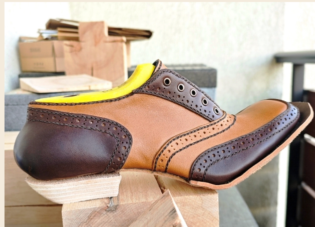
A traditional heel lift made of stacked veg tan leather is shaped accordingly to the curve of the heel