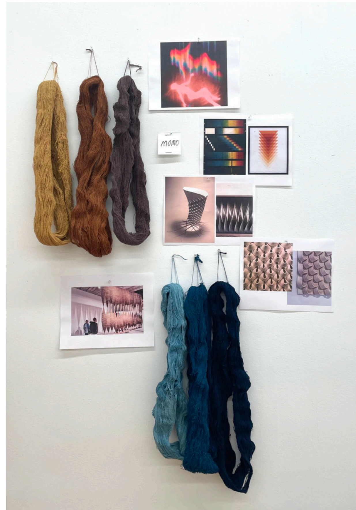
Spectrum of Natural Colors