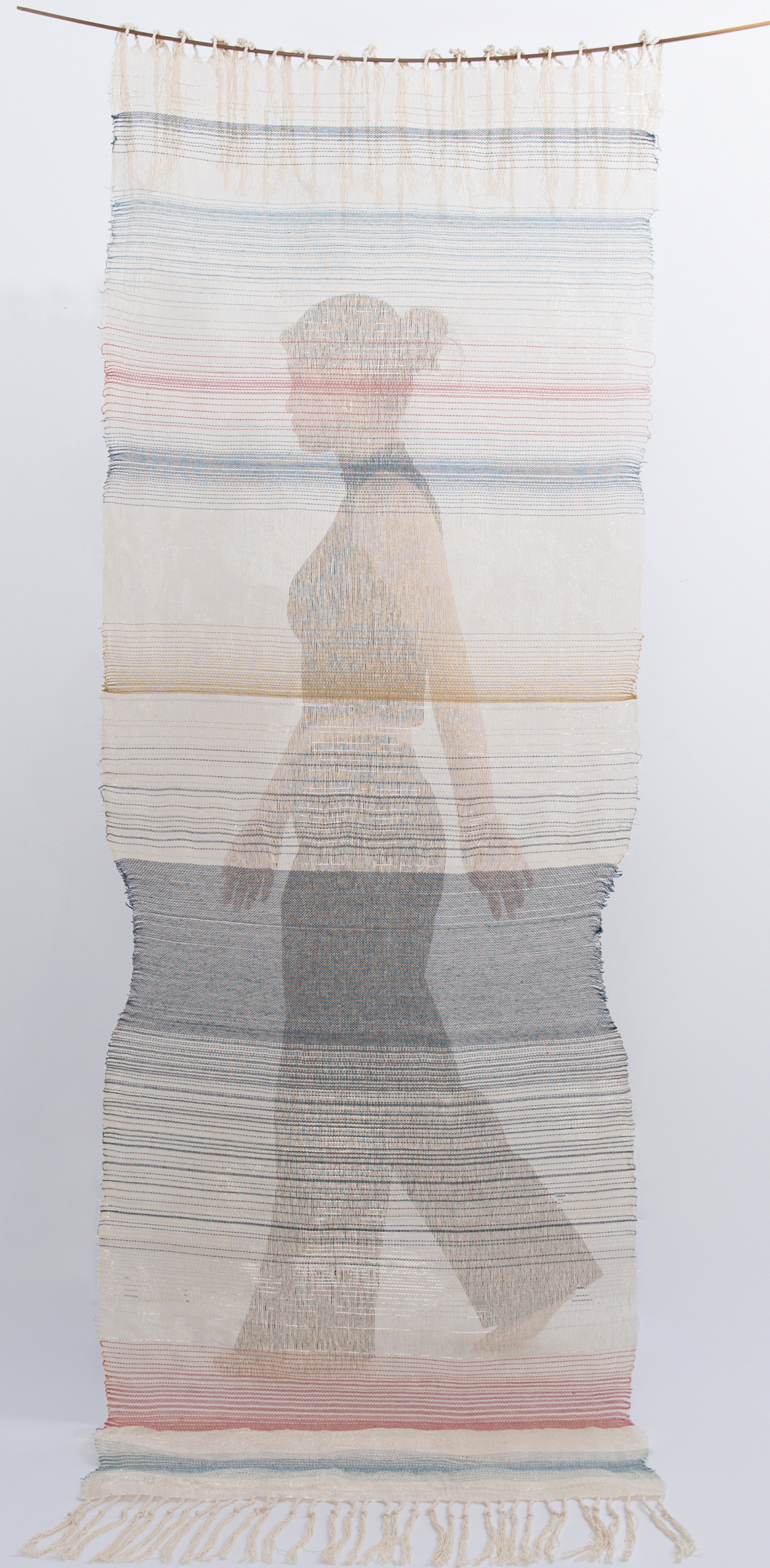
Held in Light Cotton yarn, copper wire Weaving 30" x 100" 2026