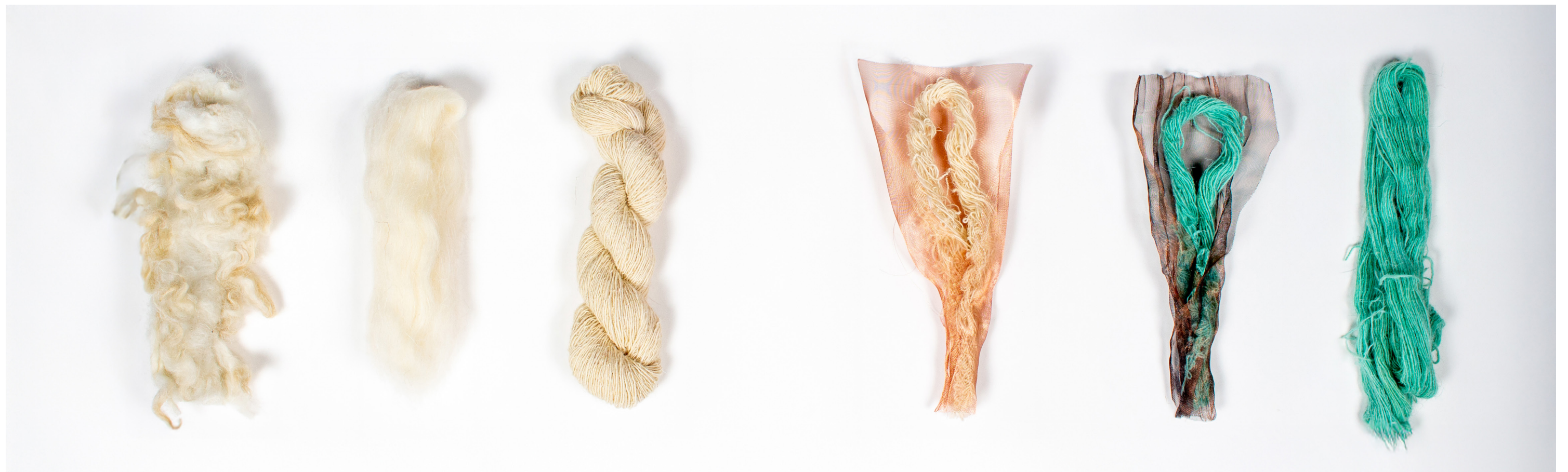
STAGE . 01 WELSH MOUNTAIN WOOL

Throughout this project, there has been a balance between working with AI tools and traditional design methods. This back and forth has created a valuable dialogue, particularly visible through the visual outputs, which have been shaped by both digital and hands on exploration. This balance was key to the decision to utilise copper to dye the wool , utilising the natural oxidation process where copper reacts with air and moisture to produce copper salts. These salts bond with the wool fibres, creating a striking teal-blue hue that reflects the project's fusion of technology and materiality.