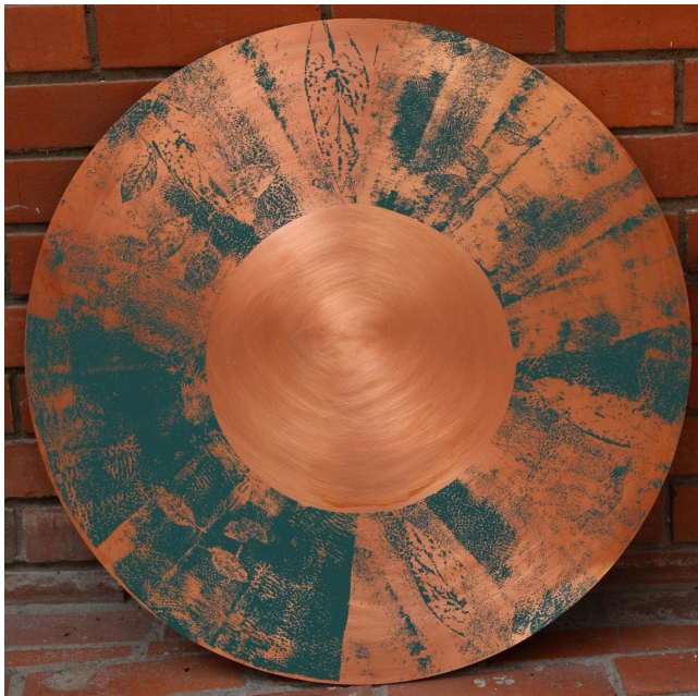
upcycled copper sourced from local hardware shop silk screen printed with sarek ink