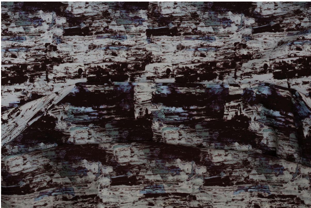
Cotton canvas digitally printed