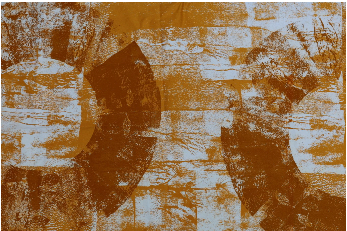
Cotton drill sourced from cloth printed with reactive dye printed paste through a silkscreen and dyed with reactive dye.