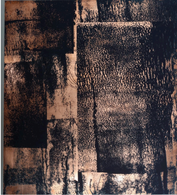
hardware shop silk screen printed with sarek ink upcycled copper sourced from local